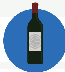
A 25-oz Bottle of Wine