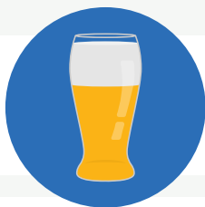
A 21-oz Ballpark Souvenir Cup of Beer

The Dietary Guidelines for Americans recommends consuming alcohol in moderation—up to one drink per day for women and up to two drinks per day for men. However, serving sizes can be deceptive. Do you know how many U.S. standard drinks are in your favorite alcoholic beverage?