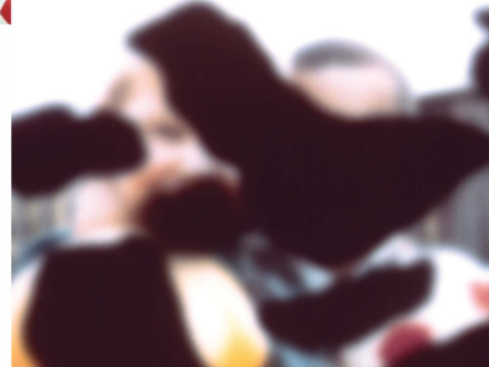
A scene as it might be viewed by a person with diabetic retinopathy.