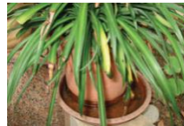
Plant Pots & Saucers