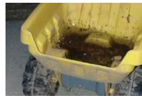
Toys left outside