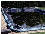
Pools & Tarps