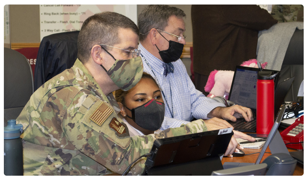
Team members implement MHS GENESIS in the Emergency Operations Center at Brooke Army Medical Center, Joint Base San Antonio-Fort Sam Houston, Texas, Jan. 22, 2022.

On January 22, Waves BAMC/LACKLAND Go-Lives began after extensive training and preparation from the MHS GENESIS team, including staff from the DHMSM program office and DHA-HI. These Waves brought six new MTF Commands online with MHS GENESIS: BAMC, Corpus Christi, Dyess AFB, Goodfellow AFB, Lackland AFB (59<sup>th</sup> MDW) and Laughlin AFB. Waves BAMC/LACKLAND bring the total number of MHS GENESIS deployments to 12 as the deployment team continues its mission of deploying MHS GENESIS to securely standardize, integrate and manage records across DoD, USCG and VA.