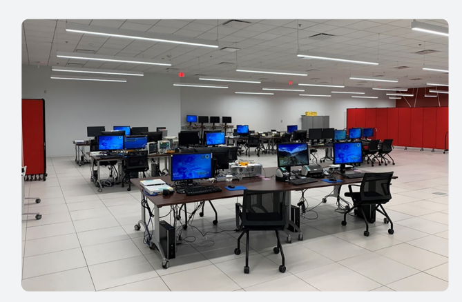
METIC testing facility in Chantilly, VA

DHMSM T&E recently celebrated its one-year anniversary at the METIC. In March 2021, DHMSM T&E relocated their fixed facility government-approved laboratory to the METIC and conducted their first test event at the facility in April 2021. The METIC provides hosting services in a secure, shared and managed facility to support federal health IT test events that require physical equipment and hands-on testing. The METIC fully integrates with PEO DHMS' virtual testing infrastructure, allowing end-to-end testing of equipment and software, leveraging connections to the MedCOI and other external entities. The METIC can accommodate software development, integration, a variety of test events as well as meetings and demonstrations. This facility hosts multiple groups concurrently, with each organization running their tests in its open and reconfigurable test space. At the METIC, groups can easily share connections to one another's environments when needed for test events.