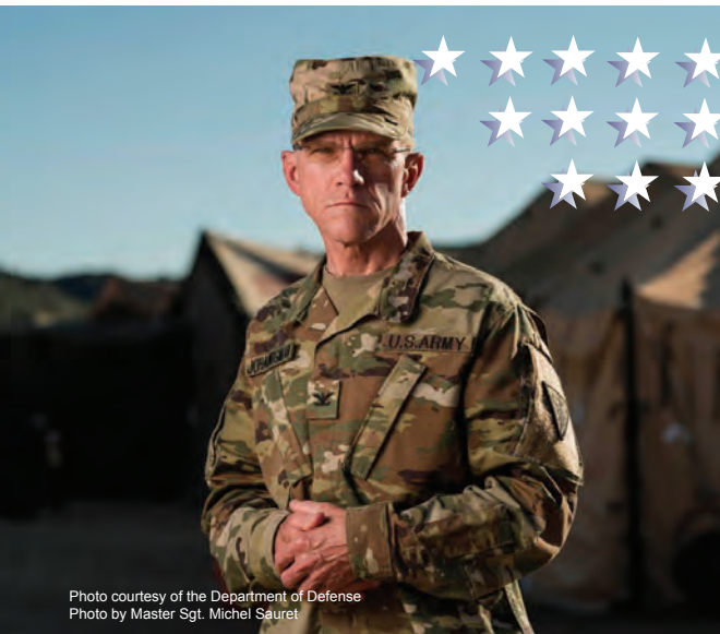
Photo courtesy of the Department of Defense Photo by Master Sgt. Michel Sauret