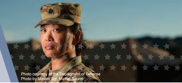
Photo courtesy of the Department of Defense Photo by Master Sgt. Michel Sauret