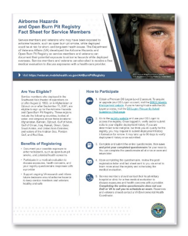
Service Member Fact Sheet

The following materials are housed on the <u>Health.mil/AHBurnPitRegistry</u> page and can be downloaded and distributed digitally or in print. Click items to begin direct download.