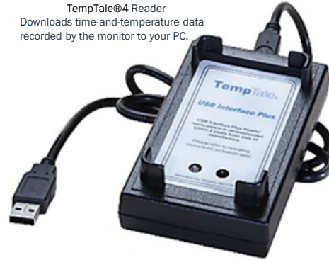
TempTale®4 Reader Downloads time-and-temperature data recorded by the monitor to your PC.