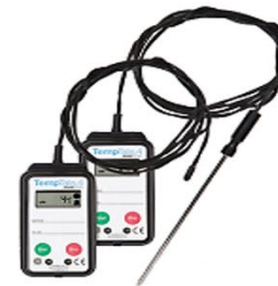
DRY ICE FLEX PROBE #N00006244 -60°C to -90°C (Initial Pfizer shipments only)